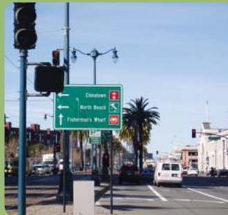
Embarcadero - San Francisco, CA