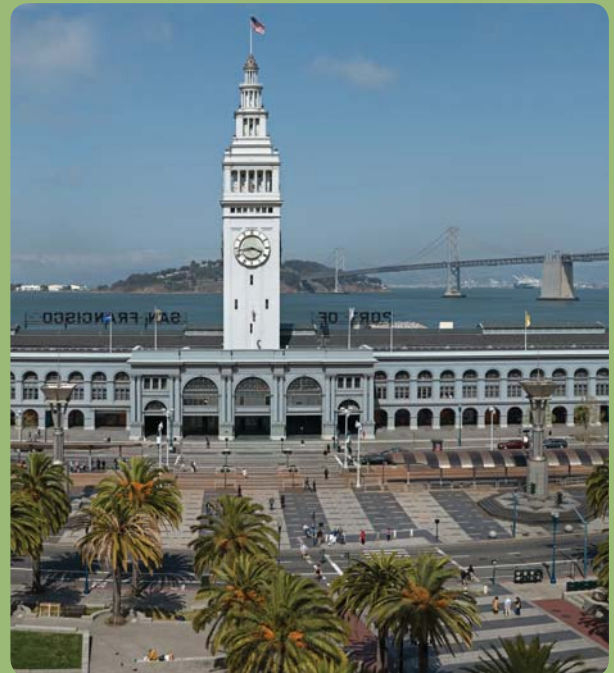
Embarcadero - San Francisco, CA