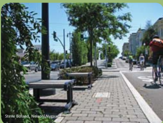
Octavia Boulevard - San Francisco, CA