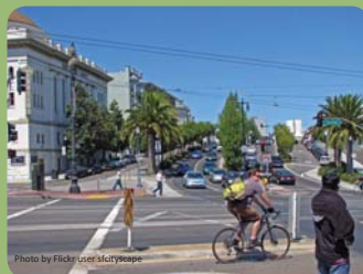
Octavia Boulevard - San Francisco, CA