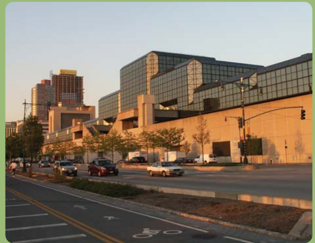
West Side Highway - New York, NY

Surrey Rapid Transit Study Design Guide - TransLink