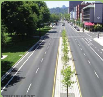
Harbor Drive - Portland, OR