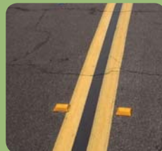
Rumble strips and reflective pavement markings