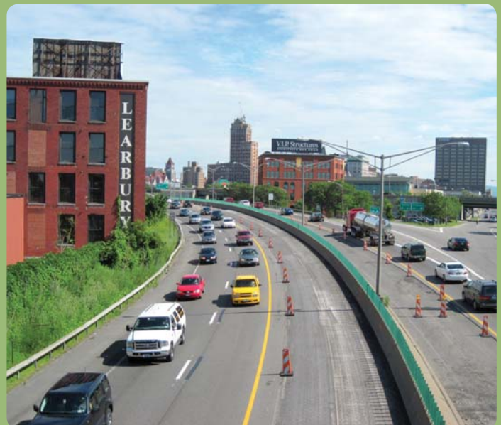
I-81 north of downtown Syracuse