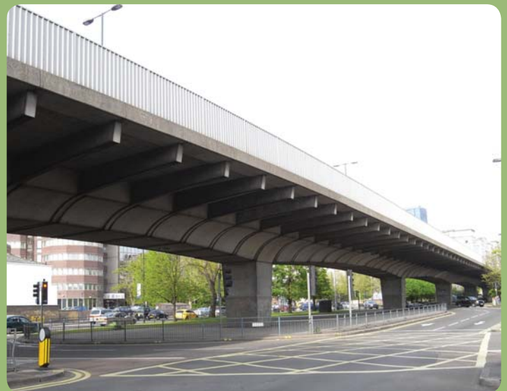
Modern steel bridge