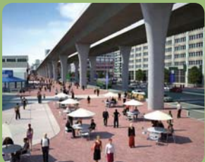
Seattle viaduct rendering