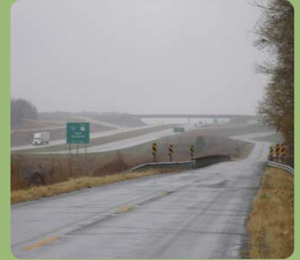
Frontage road along I-71