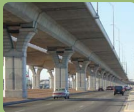
Modern concrete bridge