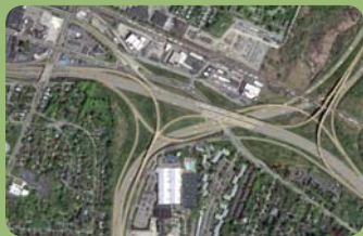
I-490/I-590 interchange, Rochester, NY