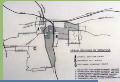
Location of areas identified for urban renewal