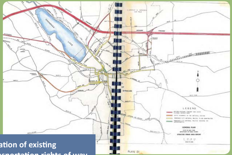
Location of existing transportation rights of way

Key factors that influenced the routes of our current highways: