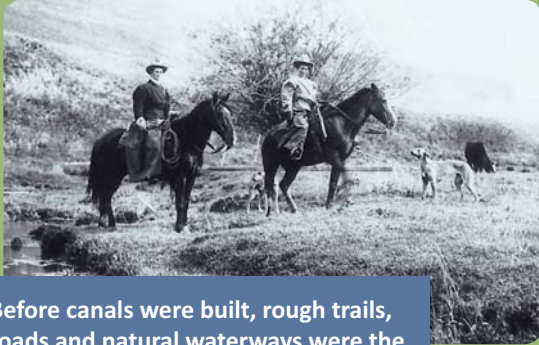
Before canals were built, rough trails, roads and natural waterways were the only ways to travel