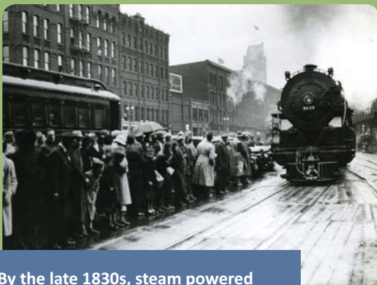
By the late 1830s, steam powered railroads had come to Syracuse