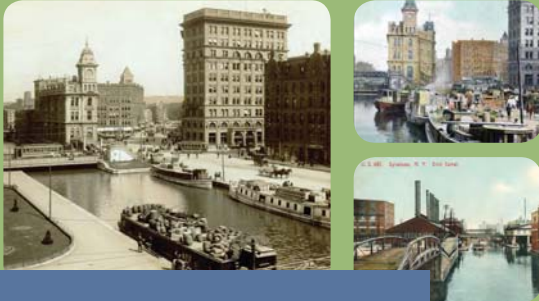
The Erie Canal, completed in 1825, ran through Syracuse and spurred economic development in the region